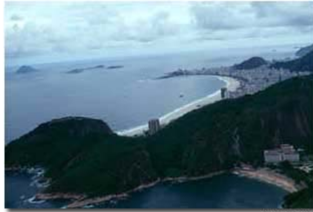
A view from the foot of Christ the Redeemer on Corcovada Mountain reveals the shapely stretch of one of Rio's legendary beaches. The city nestles between the sea and the mountains.

In 1962 on her way home from school, she regularly passed the "Bar Velos sidewalk cafe in this fashionable district where composer Antonio Carlos Jobim and poet Vinicius de Moraes hung out and were inspired to write the melanchol about this beauty with long golden hair and bright green eyes.)