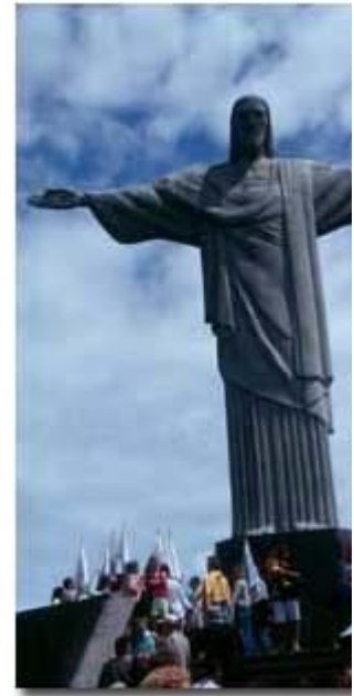
Christ the Redeemer opens I the city from atop Corcovada

The healthy Brazilian lifestyle means staying alert for those on a more determined pace than the average tourist. The tile walkways carry distinctive patterns indicating the different beaches such as Ipanema and Copacabana.