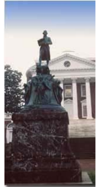
Thomas Jefferson, American president, stands proudly in front of the university he founded. This is the central campus complex architectural genius.